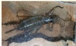
FEMALE TREE WĒTĀ